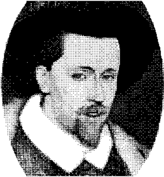
King James I of England (age 27)